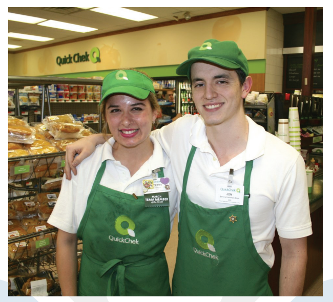
CPS helps students decide the next step after graduation, whether it is a job, day program or continuing education.

CPS helps students make informed decisions based on their abilities and needs.