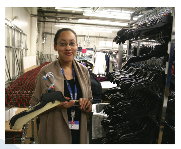
The key to community employment is the ability to become independent at the job site.

CPS Transition Specialists assist students to research and explore their employment interests. Employment Specialists focus on students' interests and abilities, so they can begin job sampling. These experiences provide valuable information to determine potential employment situations.