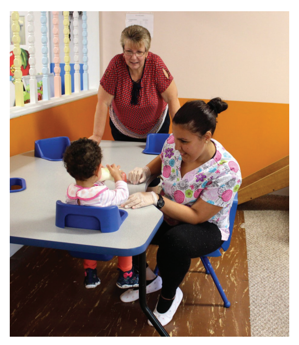
CPS Employment Specialists provide ongoing support to ensure that clients succeed on the job.

CPS is an approved New Jersey Division of Developmental Disabilities (DDD) vendor of support coordination for Union, Essex and Somerset counties.